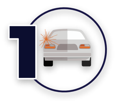
Contact our 24/7 Hotlline for instruction