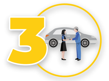
Get back your car after repairing